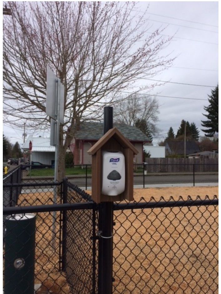
Hand Sanitizer at Dog Park