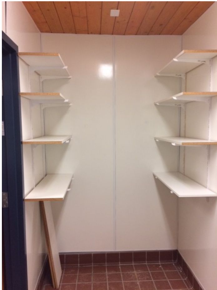
Concession Stand Closet Shelving